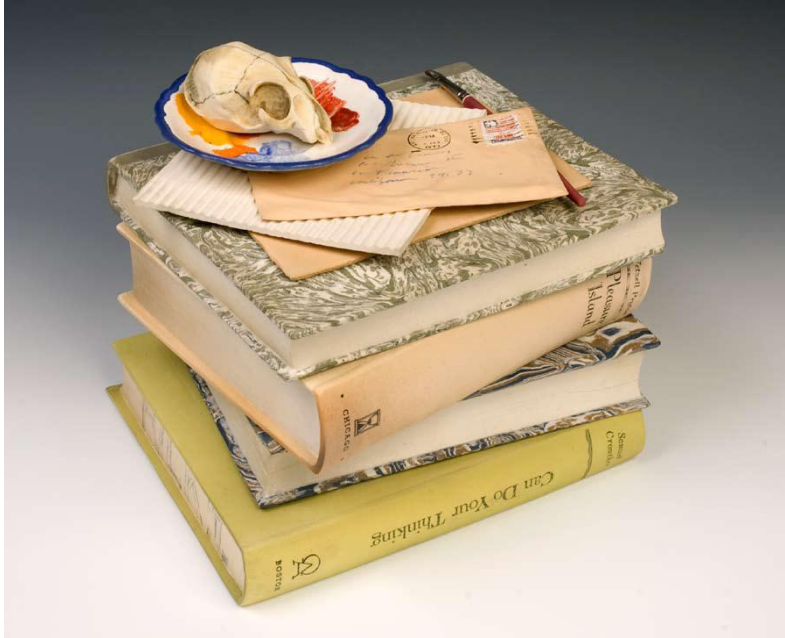
Richard Shaw, Stack of Books Jar #2 , (1978). Glazed porcelain with overglaze transfers.

This or other images of Shaw's work are available in digital format, in color. Contact the Sonoma County Museum's education curator for information.