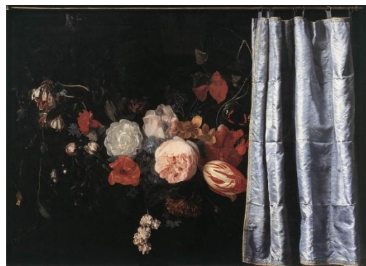
A trompe l'oeil curtain sits atop trompe l'oeil flowers. Adrian van der Spelt, Still-Life with Curtain , c.1640.

In the seventeenth century, advances in the science of optics further aided trompe l'oeil artists. Especially in Northern Europe, tools such as the portable camera obscura , a camera-like box