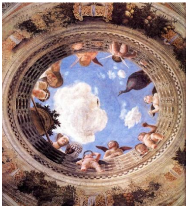
One of the most famous examples of Renaissance trompe l'oeil. Andrea Mantegna, Oculus of the Camera degli Sposi , 1465-74.

Western art has long prized this sort of illusionism. Many examples can be found in Greek and Roman art. Trompe l'oeil painting flourished during the Renaissance, when the invention of linear perspective in fifteenth-century Italy advanced painting technique, and artists strove to produce the illusion of depth and space in their works.